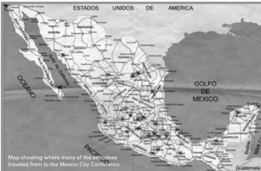
Map showing where many of the attendees traveled from to the Mexico City Conference.

While this was not the first APP event outside the US — two European Conferences have been held in Amsterdam — it was the first to be presented entirely in a language other than English. The European Conferences were conducted in English with translators available for those attendees in need. Many of the current Board attended and/or participated in the European Conference and had an idea about what to expect -- or at least thought we did -- but Mexico turned out to be an entirely different experience.