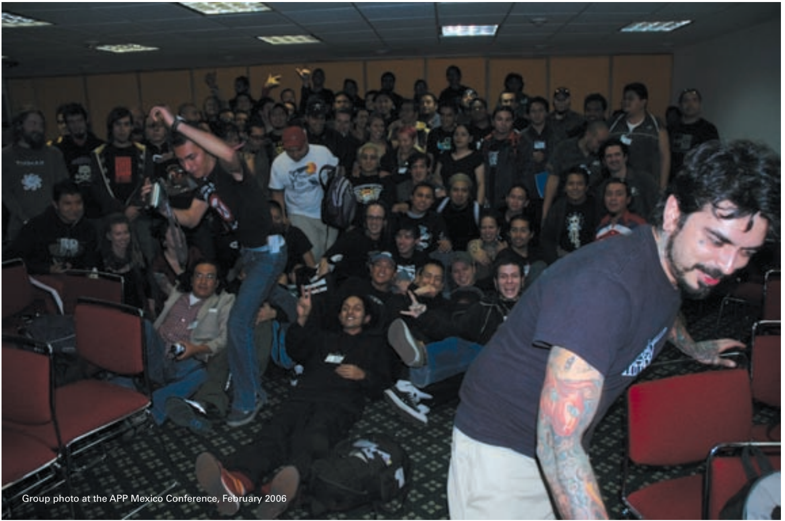
Group photo at the APP Mexico Conference, February 2006