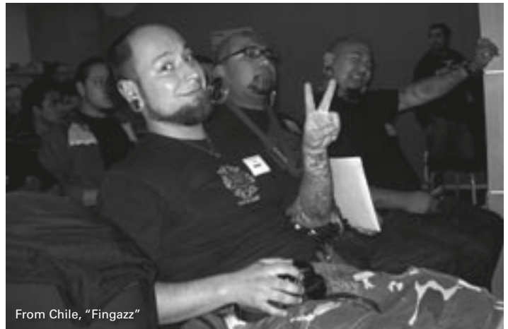
From Chile, "Fingazz"