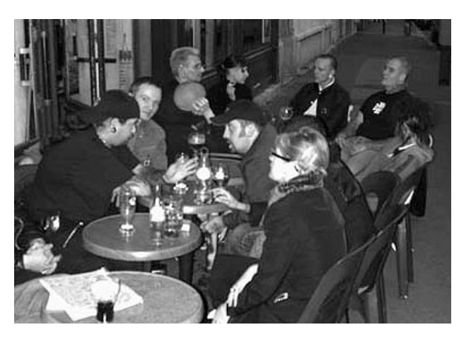
Post meeting chat