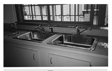
Top 19918 Aurora Ave. Seattle, WA 206-533-TOPS

If you would like to have your studio reviewed please contact Bethra Szumski c/o Virtue and Vice