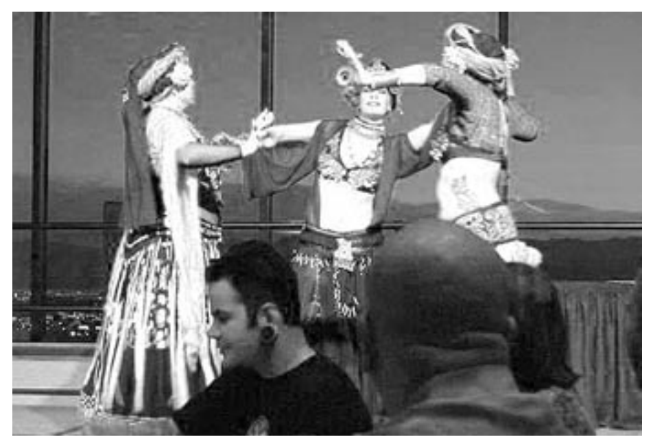
Belly dancers entertaining attendees at the banquet.

Unlike the traditional class structure with a lecturing instructor, the Round Tables have a more open format in